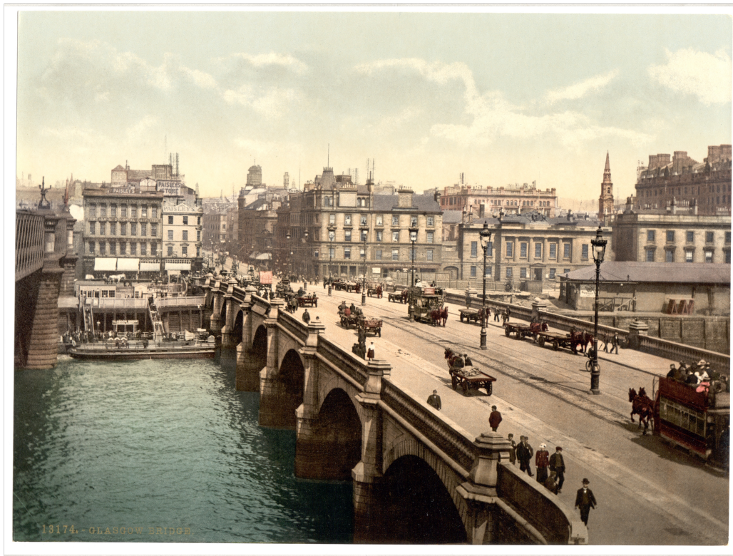
Glasgow Bridge, Glasgow Scotland

Get our historical bearings - 16th century Scotland for the origin of the word slogan, which means battle-cry