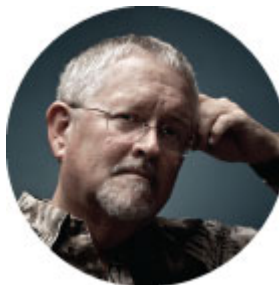
Orson Scott Card